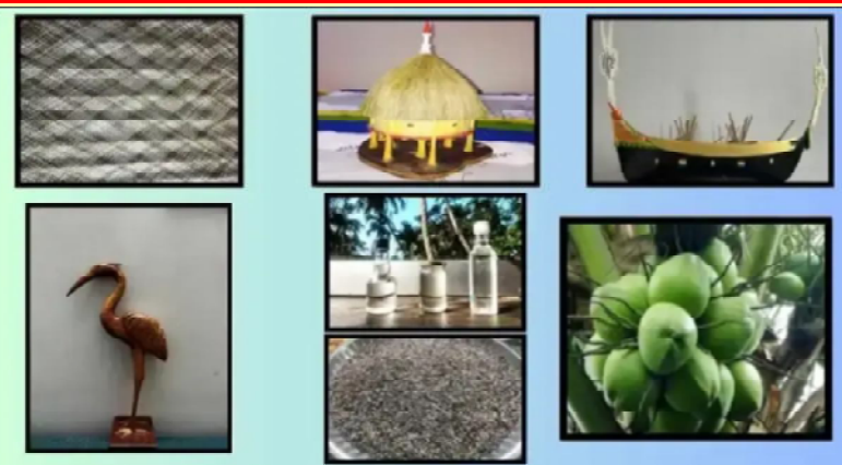
The 7 Products From Nicobar That Got GI Tag

"Friends, there is another piece of very good news from Andaman and Nicobar Islands too. Virgin coconut oil in Nicobar district has recently received the GI Tag. After the GI Tag, another new initiative has been undertaken for virgin coconut oil. Self-help groups are being formed by organizing the women associated with the production of this oil. They are also being imparted special training in marketing and branding. This is a big step towards economically empowering our tribal