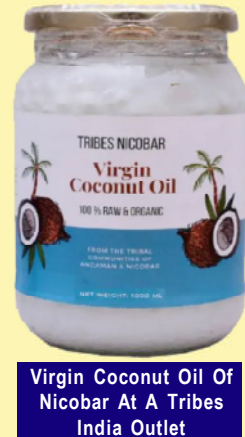
Virgin Coconut Oil Of Nicobar At A Tribes India Outlet

The tribal products are Nicobar Coconut, Nicobari Tavi-i-Ngaich (Virgin Coconut Oil), Andaman Karen Musley Rice, Nicobari Hodi (an outrigger canoe), Nicobari Mat (Chatrai-hileuoi), Nicobari Hut (To Chanvi Pati - Nyi hupul), Padauk Wood Craft.