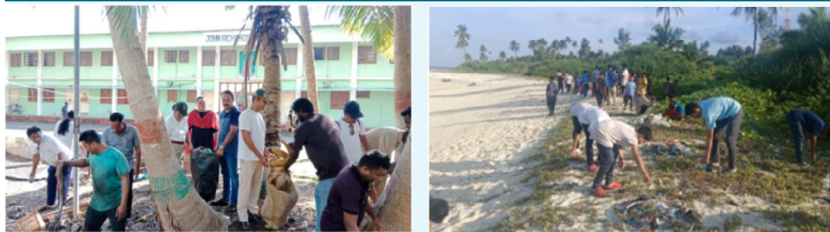
Car Nicobar, Jan. 19

Campaign reflects commitment of the district towards achieving the goals of Swachh Bharat Mission